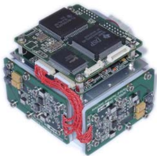
Inertial Sensors in the RT2000 product family include servo-grade accelerometers and precision MEMS angular rate sensors. Powerful 40MHz floating point DSP takes care of coning, sculling and aliasing.

Note 1. On land vehicles using Advanced Slip. Note 2: the GG-L1 mode requires a suitable base-station. See user manual for details.