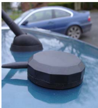
Magnetic GPS antenna for vehicle mounting. Other types available.

The internal processing includes the strapdown algorithms (using a WGS-84 earth model), Kalman filtering and in-flight alignment algorithms. The internal Pentium-class processor runs QNX real-time operating system to ensure that the outputs are always delivered on time.