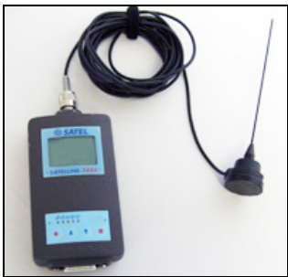
The GPS-Base includes a Remote Radio Modem and Antenna for use on the vehicle. The Radio Modem in the GPS-Base will be factory configured for use in a particular country or territory.