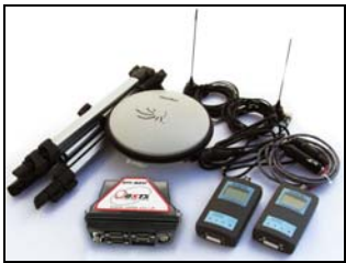
GPS-Base components, here shown with SATEL radio modems.